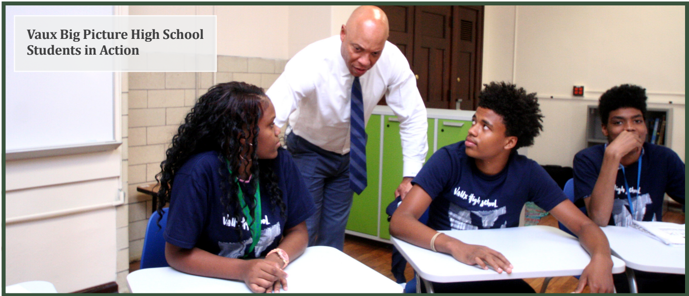
Vaux Big Picture High School Students in Action