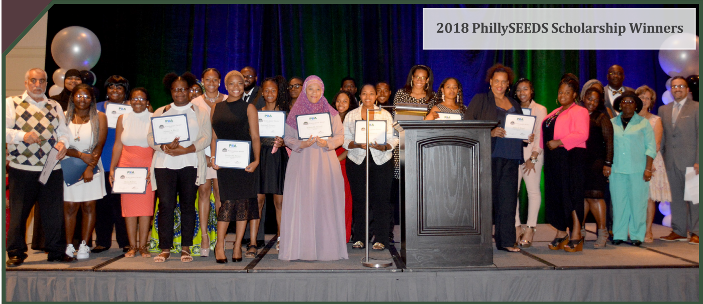
2018 PhillySEEDS Scholarship Winners